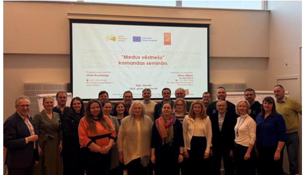
Honey ambassadors training