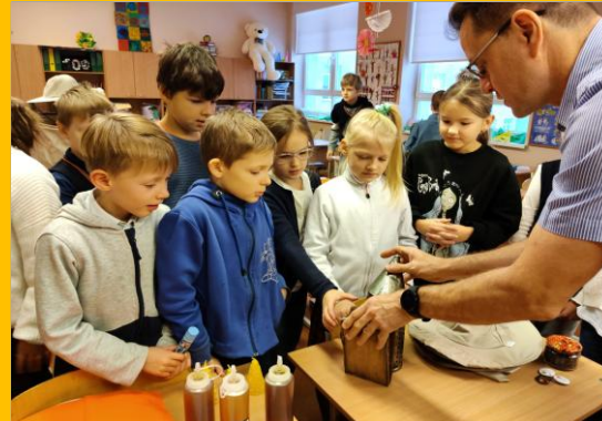
Europe honey breakfast